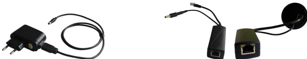
Obr.1 – Types of power supply of probe (power adapter and PoE splitter)

IP probe basis is a measuring chamber with a semiconductor detector. Radon enters the chamber by diffusion through the input filter on the bottom of probe. The probe measures in autonomous and time continuous way (continual monitor). The probe saves time records of these radon concentration values including values of humidity and temperature within its internal memory (typically at an interval of 1 hour). Next saved value is time record of measuring energy spectrum (typically at an interval of 12 hours). The probe is random for location in measured place, but generally it is put on the bottom of the probe. Bottom of the probe cannot be covered. Due to demand of permanent power supply via power adapter 230VAC/5VDC or via PoE the radon probe is mainly determinate for fixed installation and long term monitoring of radon. In case of sudden power outage probe back up running of real time for correct date and time of records for case of switch it on again.